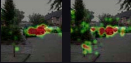
Eye tracking experiments show differences in visual interest and scan paths of drivers and pedestrians.