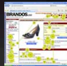
A user that searched for customer service at this web site needed almost 50 fixations to find it.